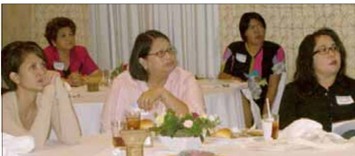
Service providers listen to a colleague provide input during Project Tinituhon's Service Provider Focus Group meeting held on June 22.

The next steps for the Project in the upcoming months include the completion of the environmental scan, additional survey interviews with consumers, and planning for the working group sessions. These activities will move Guam forward in the development of its strategic plan for a comprehensive system of services and supports for young children and their families. (See story on page 5)