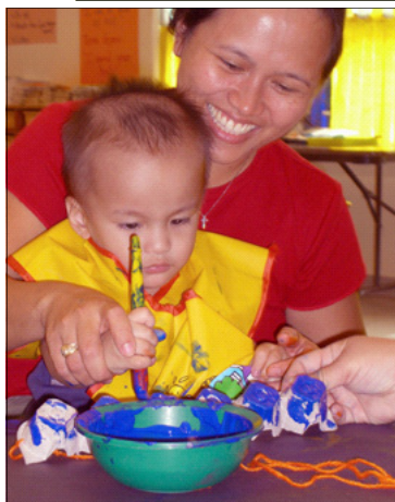
(Left photo) Mother and child "get into it" during the "Power of Play" Conference held at C.L. Taitano Elementary School on April 1. The conference, which was also held at Astumbo Elementary and Marcial Sablan Elementary, was a collaborative activity involving the Guam Early Intervention System, Head Start, and Guam CEDDERS.