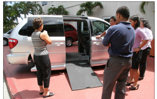
Conference attendees were very interested in the features of an accessible van sold by auto dealer Cars Plus.