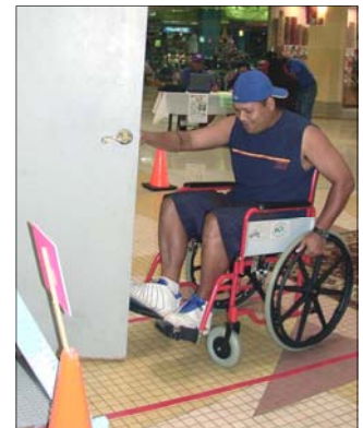
This participant finds out just how difficult it can be for a person using a wheelchair to open a door.