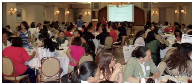
The Westin's ballroom was packed with child care providers eager to learn about Guam's Early Learning Guidelines.

Guidelines for Children Three to Five Years Old , which was adapted from the Hawaii Preschool Content Standards, and presented to participants. This milestone evolved as a response to President Bush's 2002 Good Start, Grow Smart Early Childhood Initiative to activate states and territories to strengthen early learning so that all children will have the necessary skills enabling them to be ready to learn when they enter kindergarten. This set of behaviors tells what