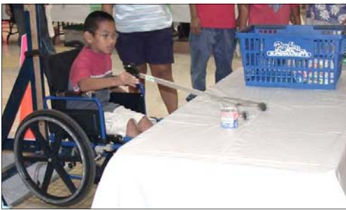
A young participant attempts one of the tasks in the Wheelchair Obstacle course.

For more information on TTY's, contact the GSAT office as they provide TTY's on short term loan and training on how to use them.