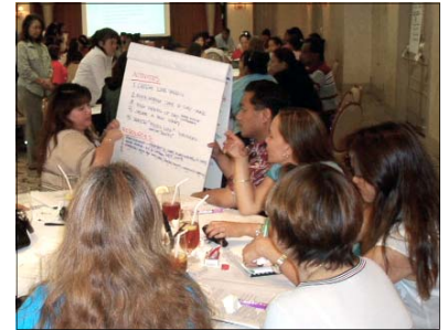
Participants at the 2005 Training Institute.

Every participant went home with a wealth of resources including Good Start, Grow Smart, the Guam Early Learning Guidelines, the Institute’s presentations on Strategies to Implement Early Learning Guidelines for Children Three to Five Years Old, and a folder filled with units and lesson plans field tested by Directors and Staff of Guam’s six Model Child Care Centers.