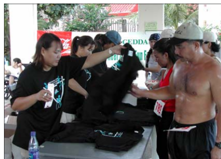
Guam CEDDERS staff pass out T-shirts to the first 350 finishers. Refreshments and raffle prizes were also given out.