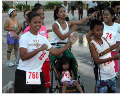
Participants gear up for the event.