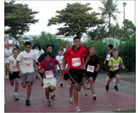
These members of the younger crowd opted for the one mile event.