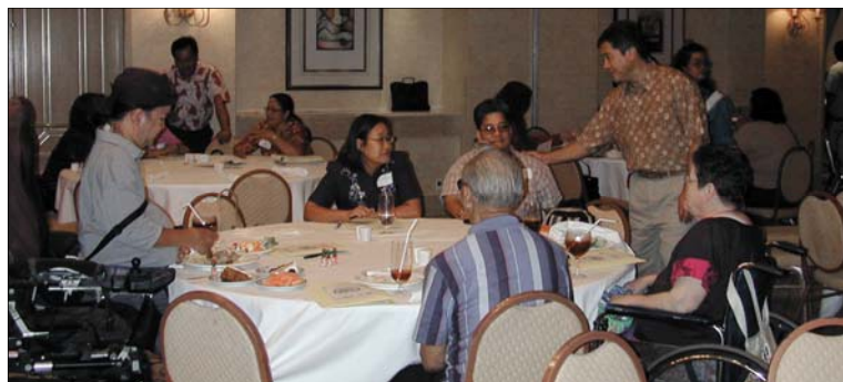
Governor Felix P. Camacho ( standing at the right ) meets with participants at GSAT's Conference.