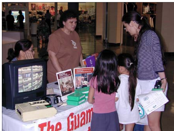
Participants make inquiries with the Guam Public Library's staff during GSAT's 10th Anniversary Fair held at the Guam Premier Outlets.