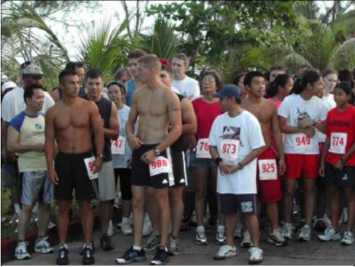
Participants get ready for the start. It was great weather for the event.