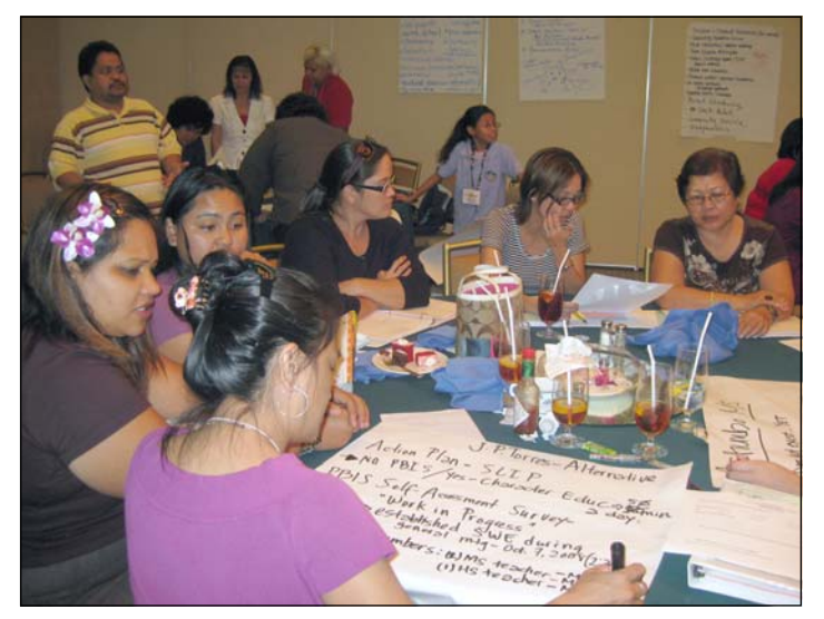
School teams working hard on their Action Plans for PBIS Implementation.