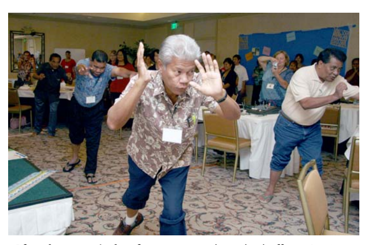
After long periods of concentrated cerebral efforts, Institute participants "get up and move" to get the blood flowing during a break.

The PACIFIC Project is funded by a U.S. Department of Education, Office of Special Education Programs, General Supervision Enhancement Grant.