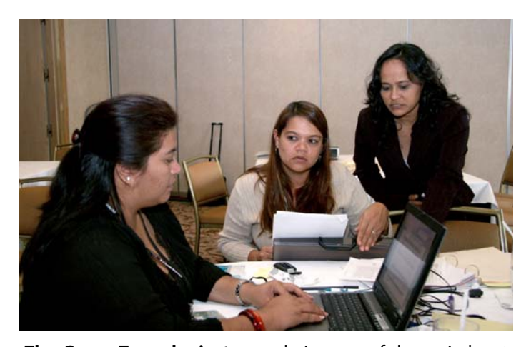
The Guam Team brainstorms during one of the periods set aside for entities to develop implementation strategies specific to their local school system.