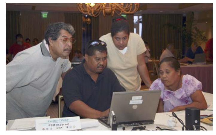
Team Kosrae focuses on developing a lesson for students with print disabilities using the assistive technology provided by the CIMAP project.